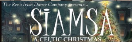
A Holiday Musical for the Entire Family!