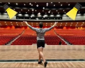
EXCITED TO BE DANCING WITH @SHAMROCKPRODUCTIONS