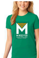
LADIES GREEN SAINT PATRICK'S DAY SHIRT from $20.00