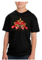
YOUTH SIZE BLACK CELTIC KNOT SHIRT from $18.00