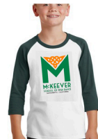
YOUTH LONG-SLEEVED SIZE GREEN SHIRT from $22.00