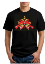
ADULT SIZE BLACK CELTIC KNOT SHIRT from $20.00