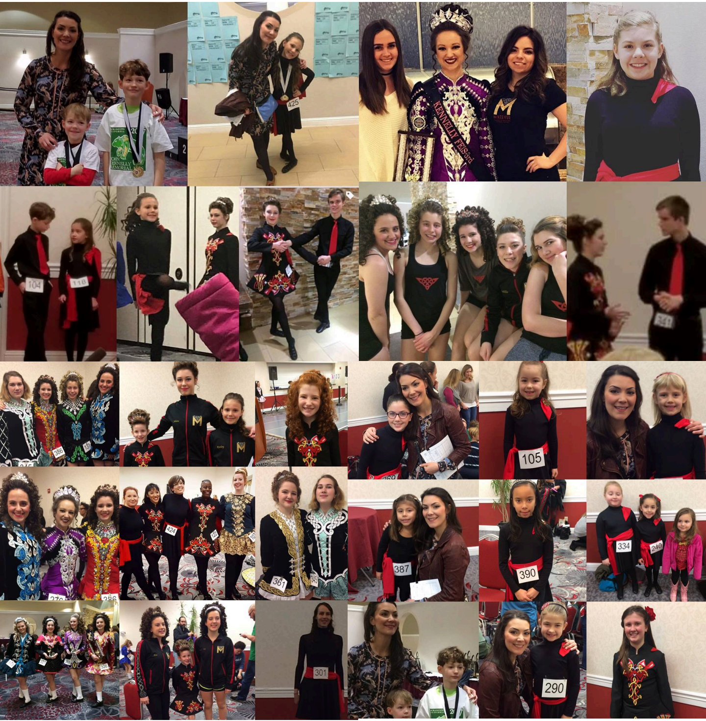
Dancers at the John Kennelly Memorial Feis – Story on the next page