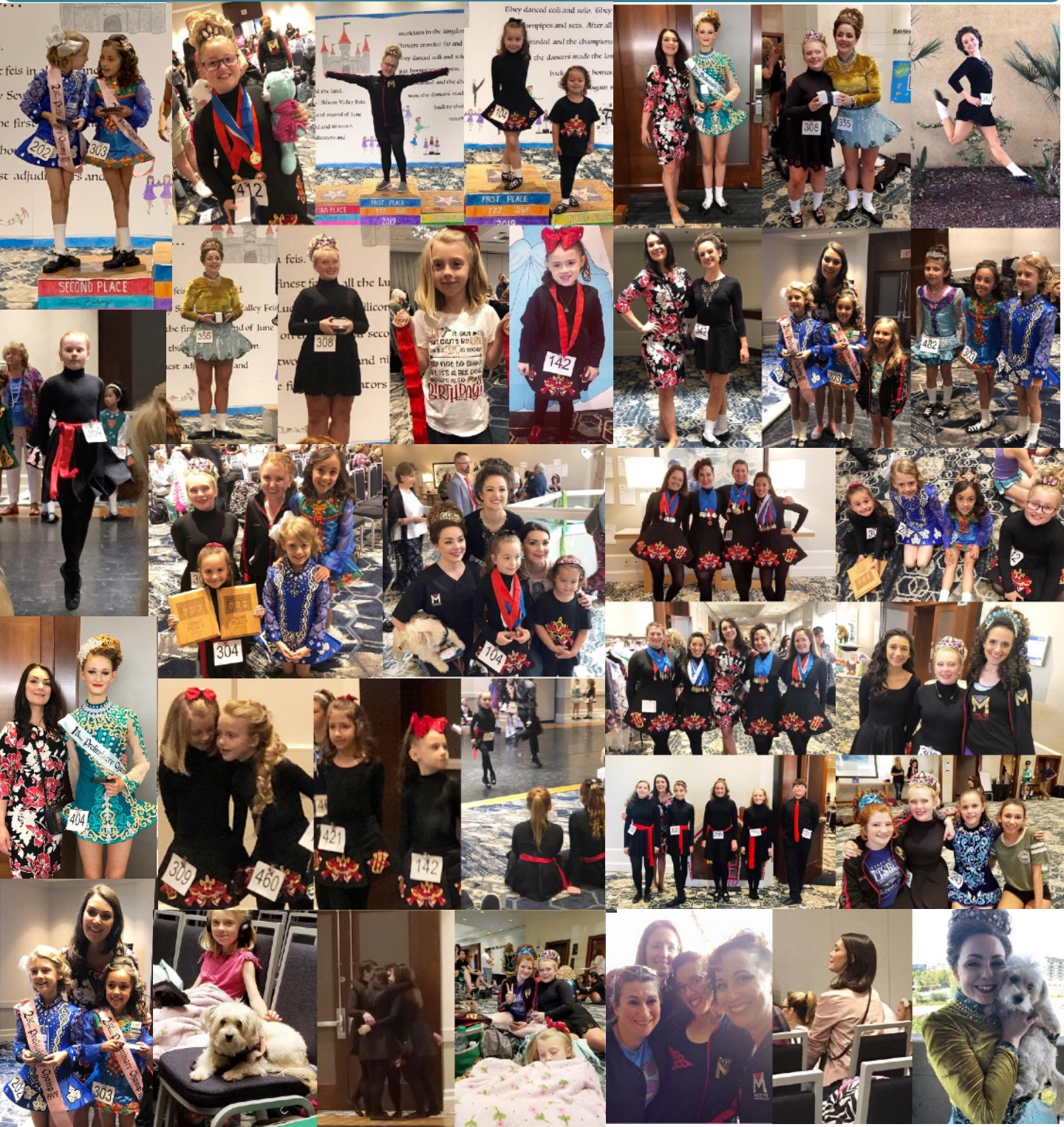
Some of the highlights of the Lucky Sevens Feis that happened in San Jose the first weekend in June. This is our fifth year attending the event as a school. More on the next page...