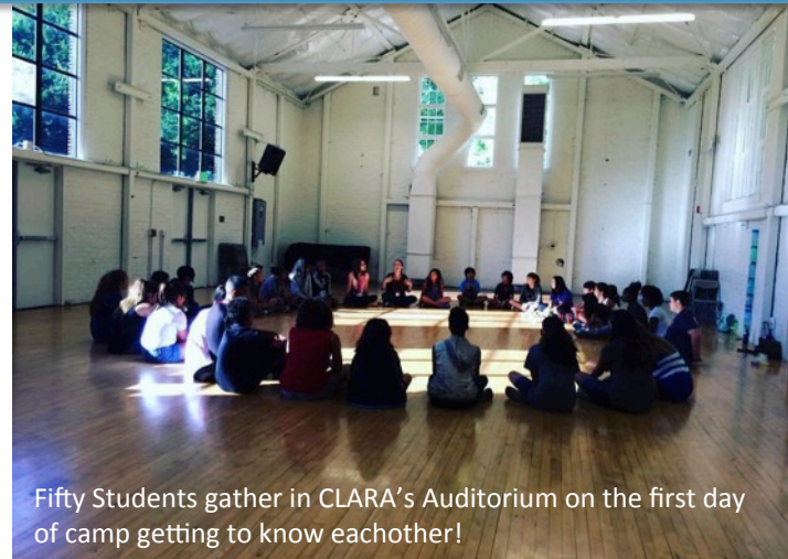
Fifty Students gather in CLARA's Auditorium on the first day of camp getting to know each other!

CLARA's First ever free Summer Camp for students going into the seventh grade from Sac City Unified School District has been taking place these last two weeks of June. The camp runs from 8am-3pm and students take classes from all of CLARA's tenants! Classes include Irish Dance, Hip Hop, Contemporary Dance, Batacuda Drumming, Improvisation, French Etiquette, Guitar, Samba, Voice, Acting, Poetry/Theater, Poster Design, Scenic Design and Audition Skills!! All of these classes culminate into a end of camp performance where students get to share what they have learned! This is one of the amazing outreach opportunities CLARA was designed for, hopefully promoting the Arts and making it more accessible to our community!