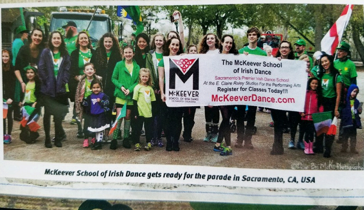
McKeever School of Irish Dance gets ready for the parade in Sacramento, CA, USA

McKeever School of Irish Dance, Sacramento, CA, USA