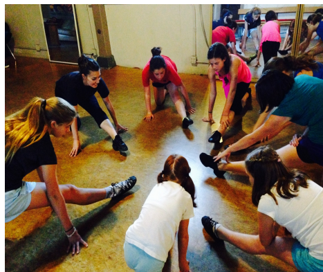
Students stretching after class on a Tuesday night!

Our School Costumes are being made for those dancers who placed orders in January, and the Celtic Knot-work has had a slight update! We can't wait to see the finished results!!! The yellow is metallic gold in real life.